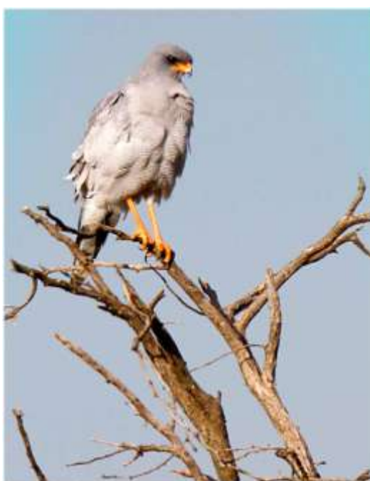
Piet Venter - Valk