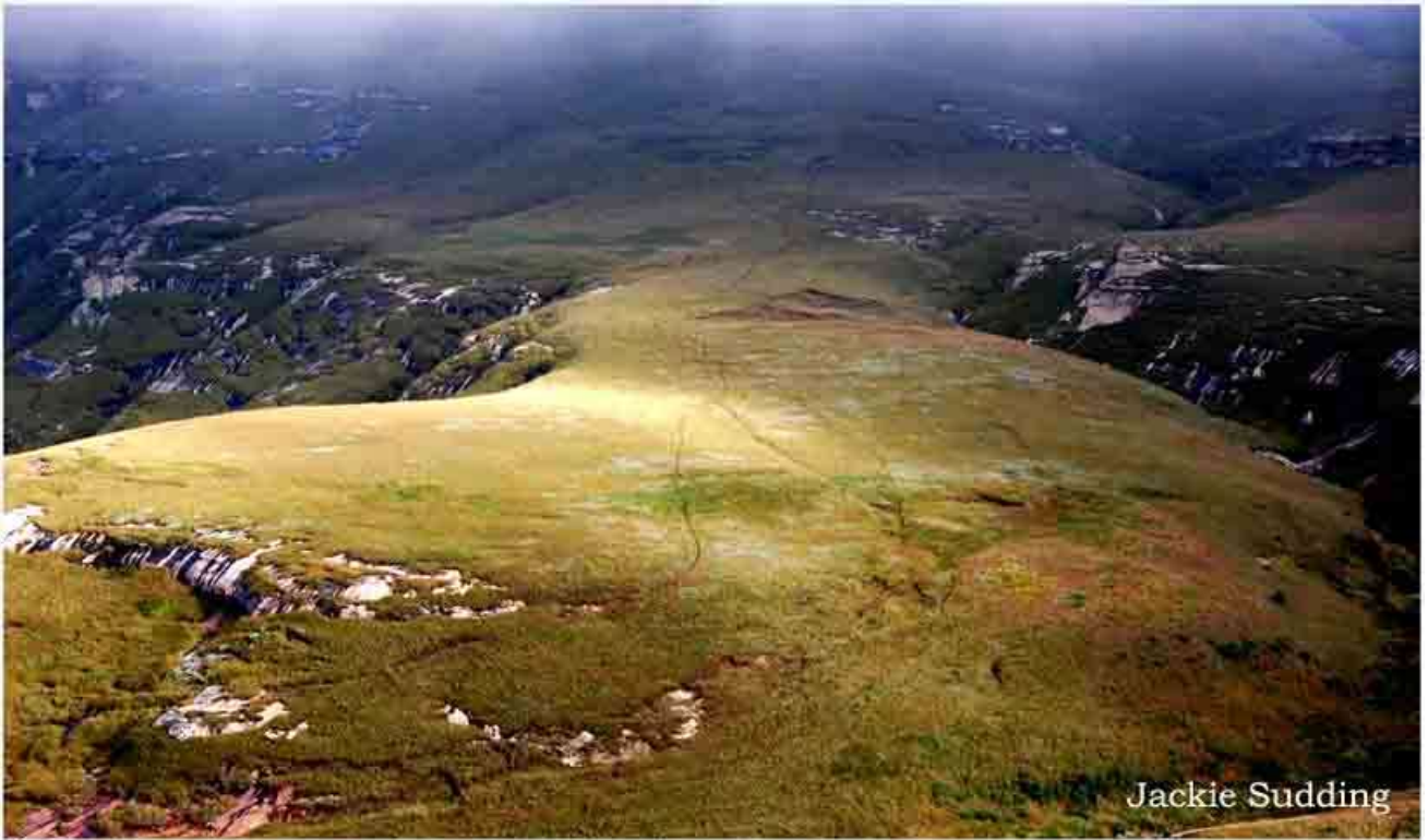
Jackie Sudding - mountain lane C.O.M 3*