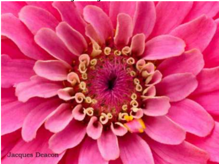
Jacques Deacon - pink C.O.M. of pink in the new black Salon 2*

Baie geluk aan Jacques Deacon vir die beste foto ingeskryf in 1-3* Die foto het ook vir Jacques sy eerste Salon aanvaarding besorg.