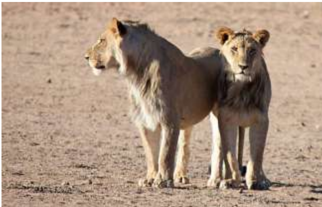
Piet Venter - brothers

Toekomsplanne: Werk daaraan om 5Ster te kry en dan nog verder te gaan.