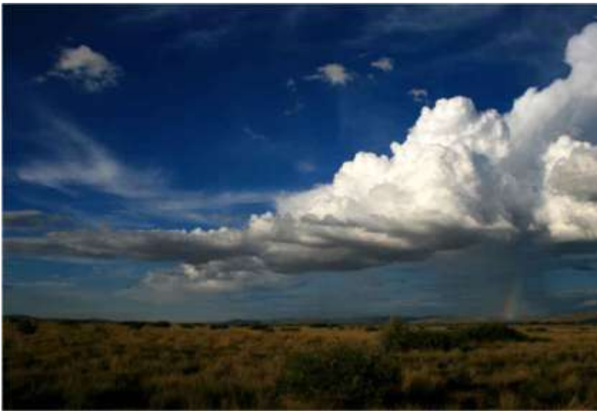
Sonja Grobler - onweerswolke oor die Karoo salon aanvaarding