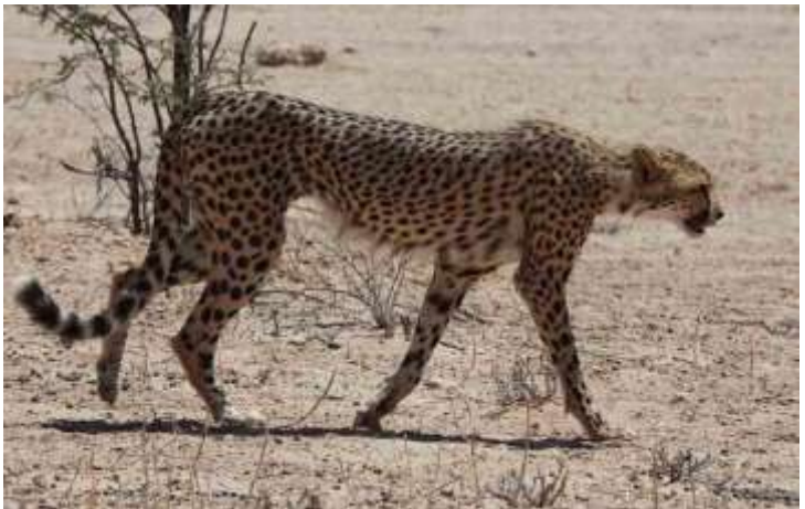
Piet Venter - on the Hunt