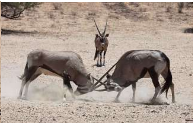
Piet Venter - referee