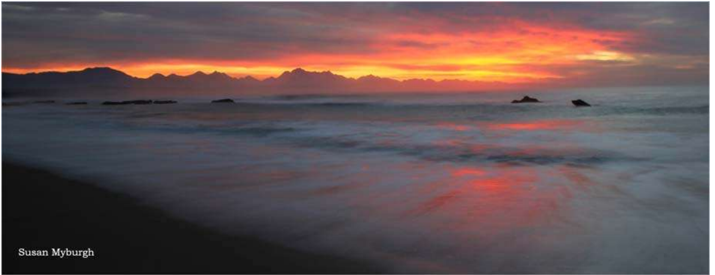
Susan Myburgh - glowing morning salon aanvaarding