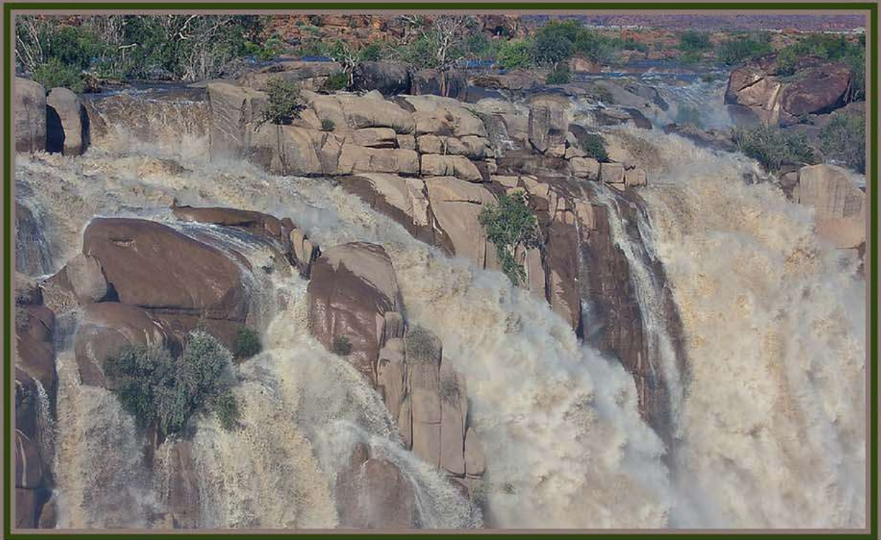
Augrabies - Piet Venter