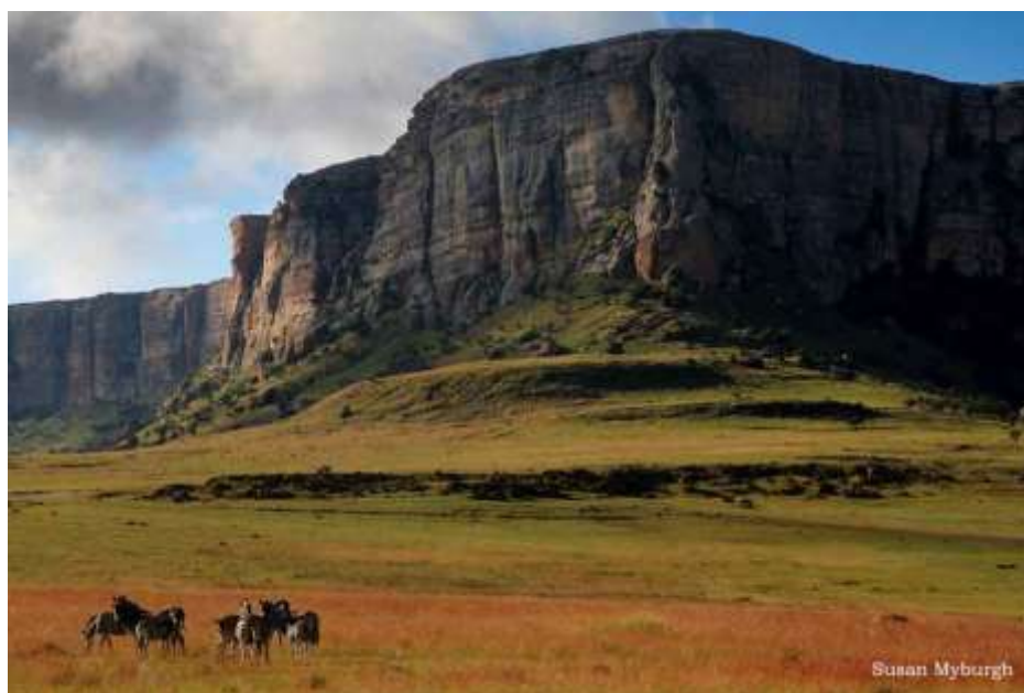
Susan Myburgh - klein vs groot- salon aanvaarding