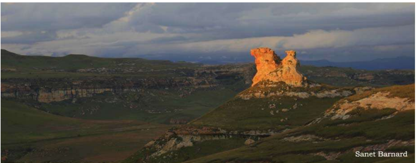
Sanet Barnard - goue namiddag C.O.M 2*