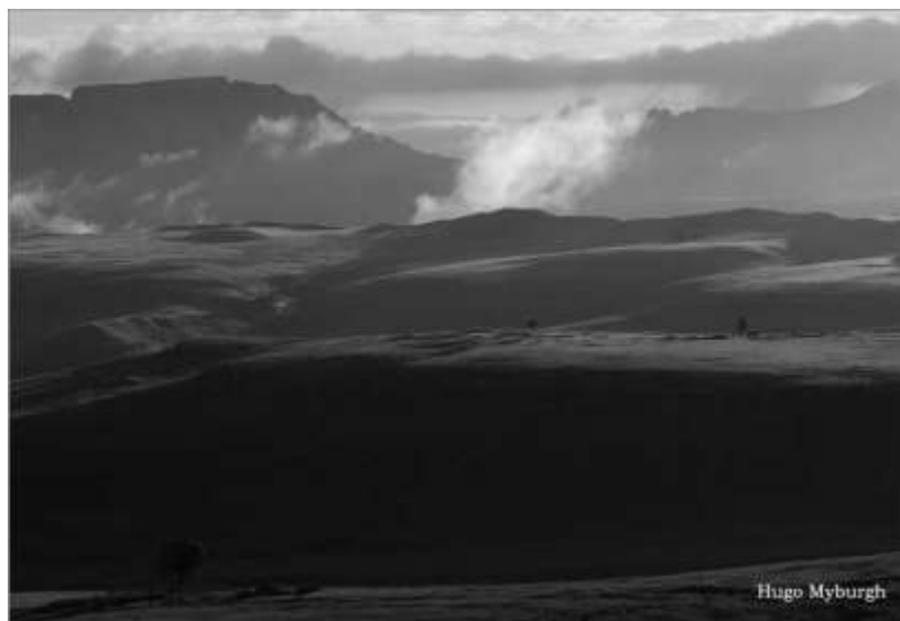
Hugo Myburgh - low ligh salon aanvaarding