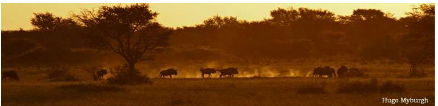
Hugo Myburgh - Kgalagadi Sunset Salon aanvaarding 5*