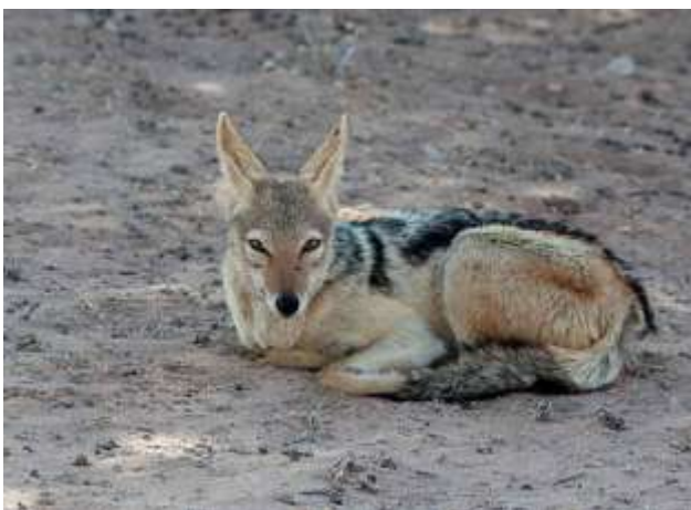
Piet Venter - Not Happy