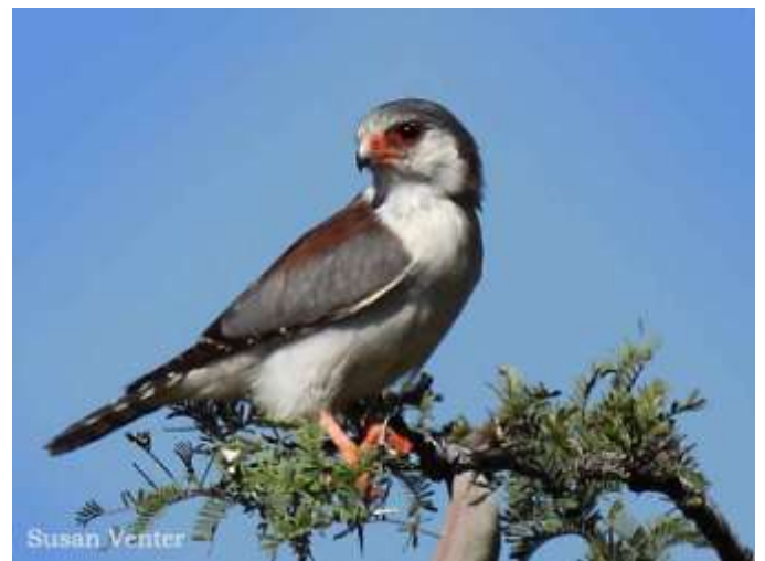
Susan Venter - Dwergvalk C.O.M. 2*