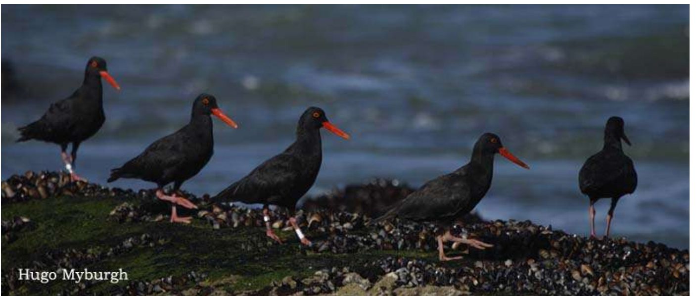
Hugo Myburgh - Oystercatchers in a row Salon aanvaarding