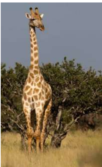
Piet Venter - Kameelperd